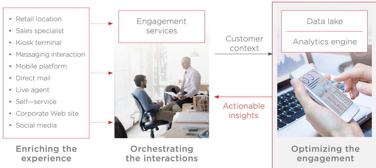
Figure 4. Optimizing customer engagement through actionable insights Avaya Customer Engagement solutions optimize customer engagements. You gain a deeper understanding of your customer service operations and have the ability to improve and adapt them to deliver an optimal customer experience.