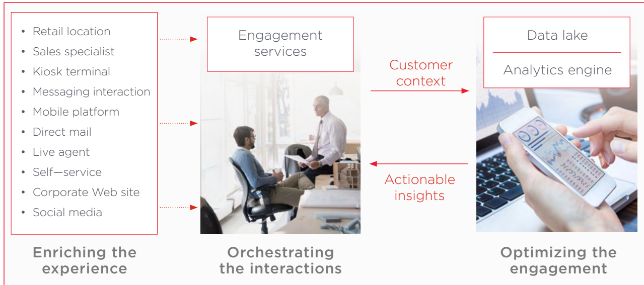
Figure 5. Delivering a contextually aware, persistent customer experience. The foundation of Avaya Customer Engagement solutions is the Avaya Aura® Platform, which helps you transform how you communicate, collaborate and serve your customers. You can integrate and deliver voice, video, data and Web communications applications and services to your employees anywhere—whether they’re in the office or on the go.

Through persistent conversations, your organization can deliver a holistic, personalized and enduring customer experience.