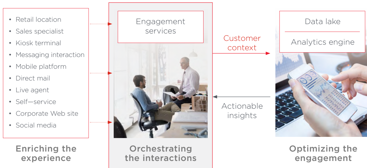
Figure 3. Orchestrating the customer interactions by delivering customer intelligence Avaya Customer Engagement solutions orchestrate customer interactions with a single pool of resources (agents, knowledge bases, automation services, etc.) regardless of location. By assisting your customers and prospects through their preferred interaction channel, you can deliver the right customer experience every time.