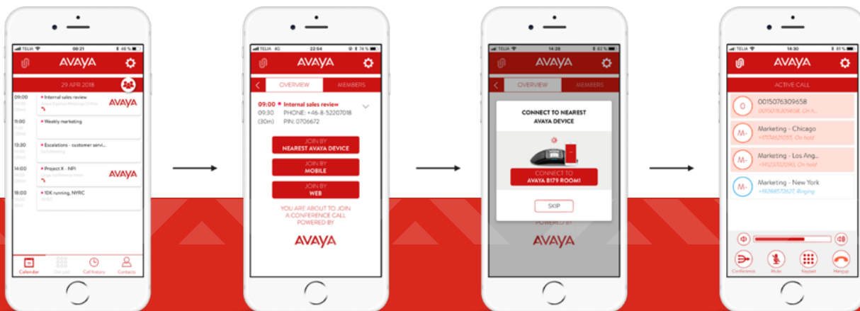
Figure1: Screen Shots showing Calendar, Connection Options, and Conference Controls