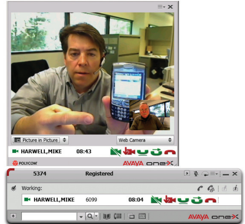
Figure 1: one-X Agent user interface with video

From a contact center manager and supervisor perspective, the physical location of an agent is transparent, allowing the focus to remain on agent performance. This means the same robust reporting and monitoring is available for remote agents as those physically located in a contact center. Remote training, support and coaching is facilitated through embedded video tutorials, context sensitive help as well as collaborative capabilities inherent in the agent desktop application, Avaya one-X® Agent.