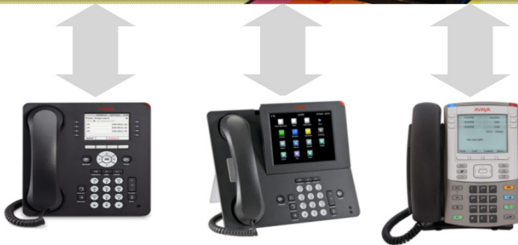
Avaya ACE™ 3.0 CRM Integration