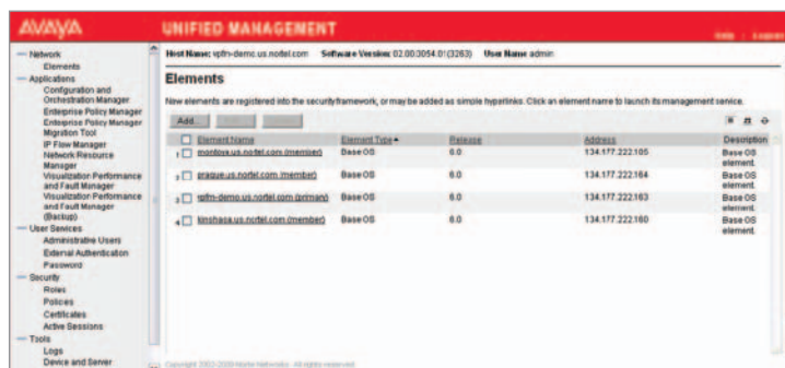
Figure 3. Avaya Unified Management Navigation Page. From this page, administrators can navigate to any network management (i.e., voice, data and application) or network element. Several applications can be opened at the same time.